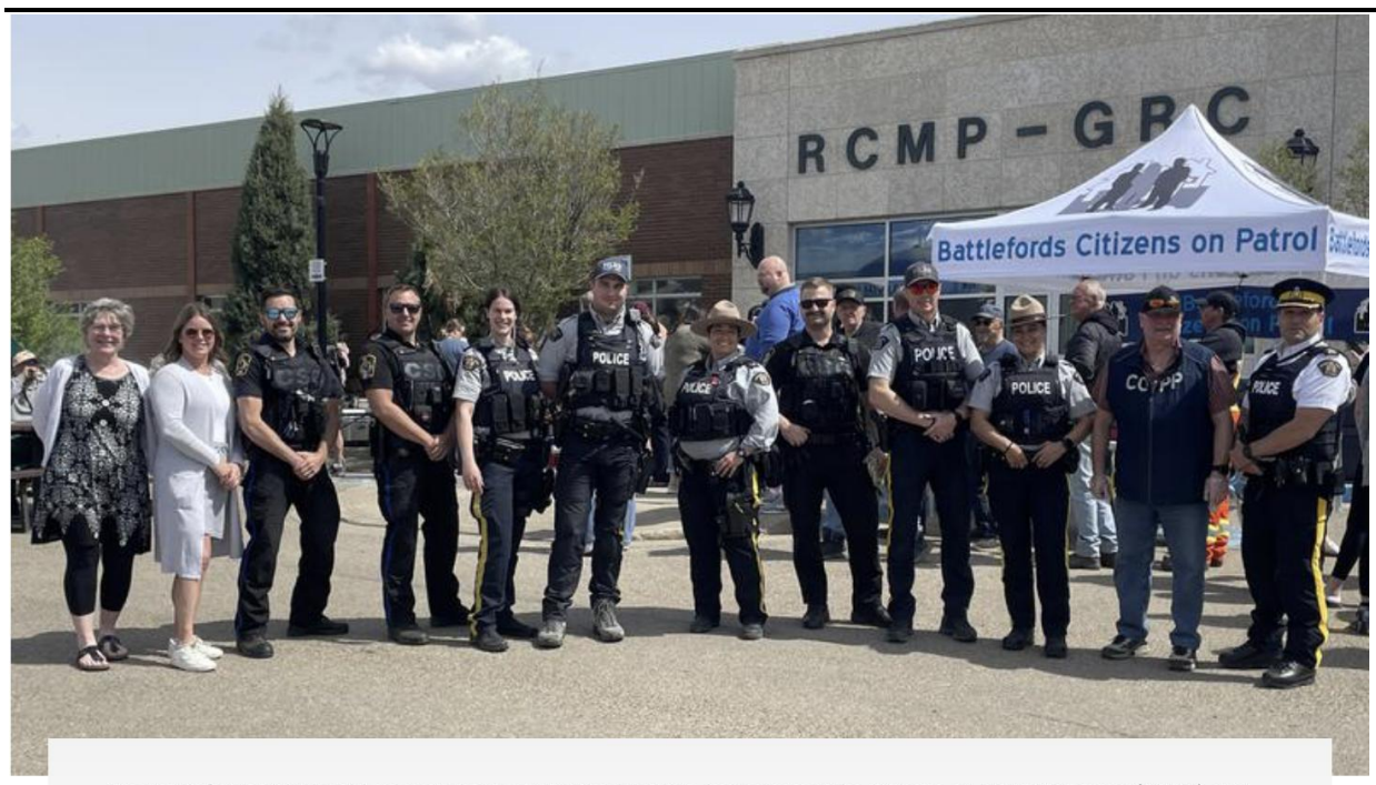
EXHIBIT "A" - VOLUNTEER (S)

The Battlefords RCMP held an open house on Friday, May 9 to help support the Citizens on Patrol Program (COPP) and Concern for Youth program.